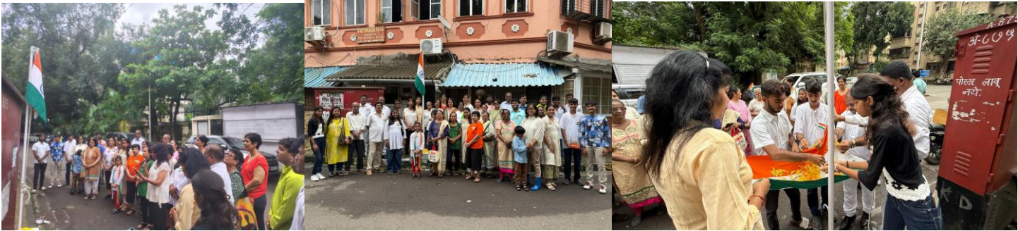
FLAG HOISTING CEREMONY IN MARY HELP OF CHRISTIANS COMMUNITY