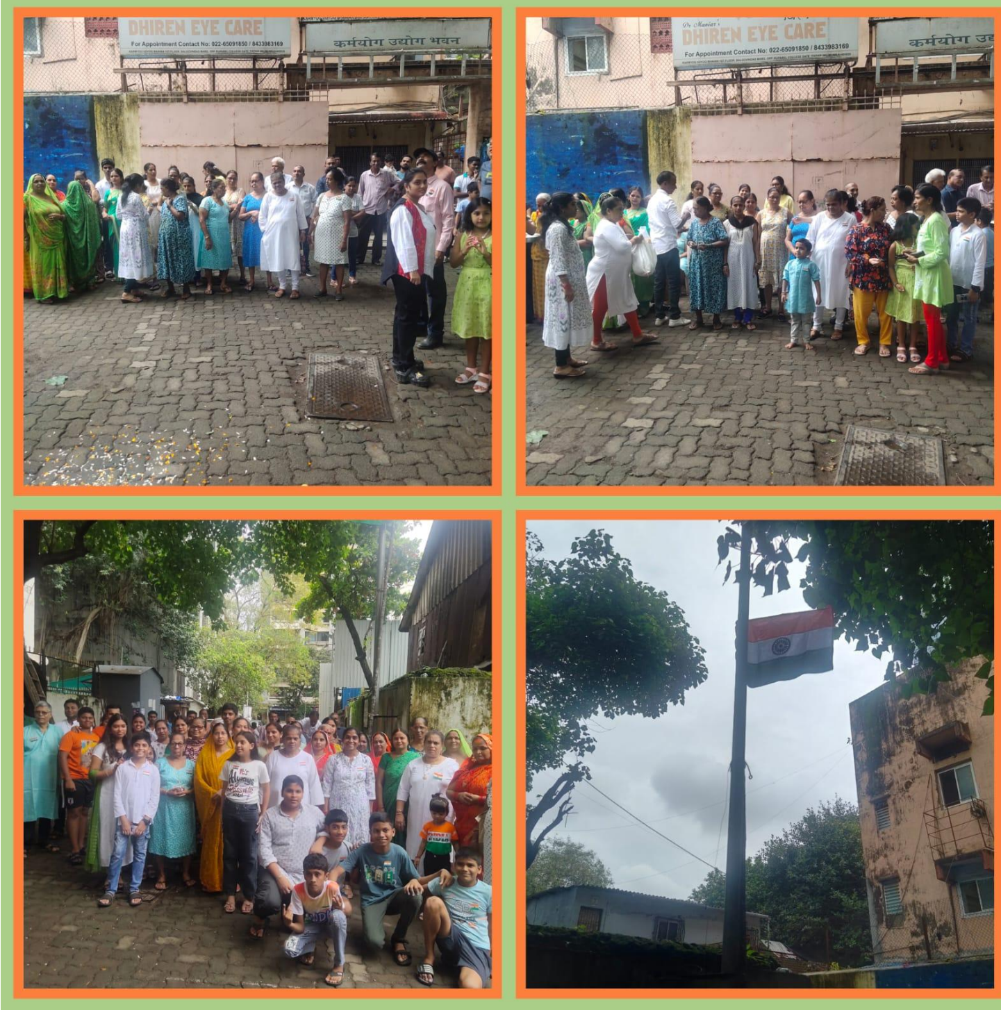
FLAG HOISTING CEREMONY IN ST. ANN COMMUNITY