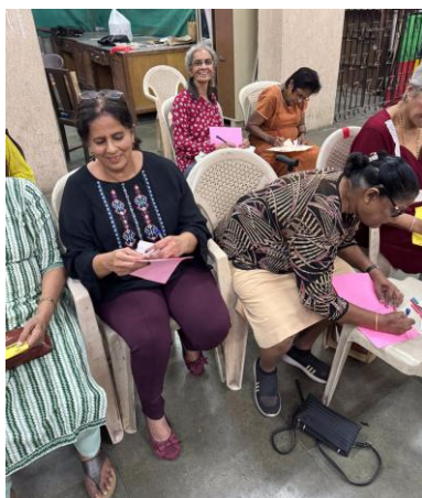
Getting crafty with care creating