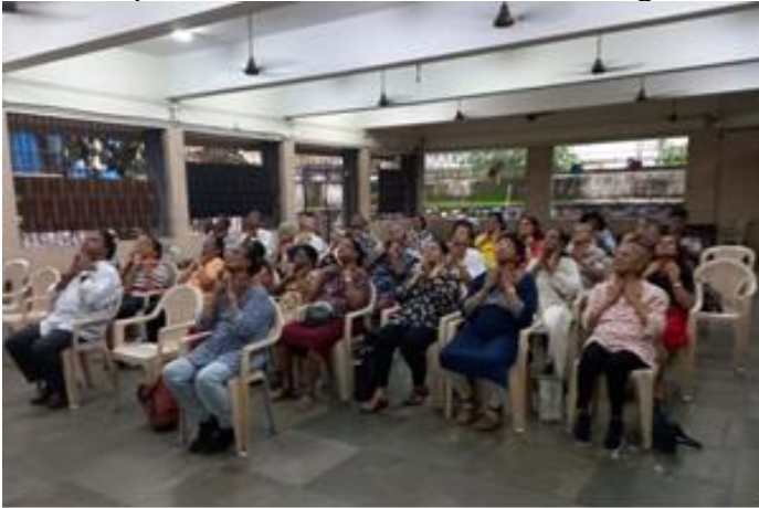
stretches to keep the pain in the neck away