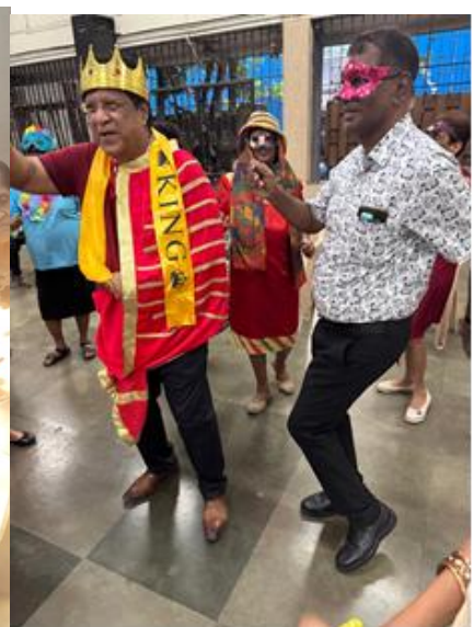
Crowned in gold and dancing bold, King Momo leads a masquerade of joy and laughter