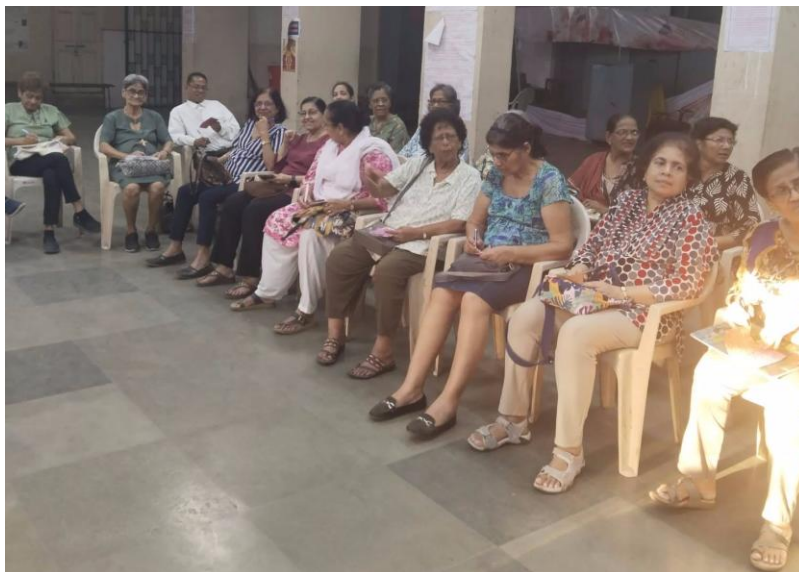
Bumper housie in session - fun has no age limit!